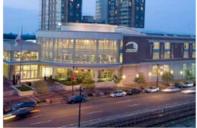
Boston University’s Sustainability Revolving Loan Fund financed the Campus Fitness Center lighting and energy upgrades, a building renovation that has saved the University as much as 546,000 kWh a year.

This Investment Primer is designed for key decision makers, such as senior financial officers or boards of trustees’ investment committees, who want to learn more about developing a GRF. It discusses critical financial and fund-structuring issues that institutions should consider when developing a GRF. Recommendations are based on research conducted by the Sustainable Endowments Institute for its report Greening the Bottom Line greenbillion.org/resources , and on interviews with experts in higher education finance, operations and sustainability.