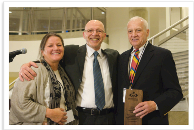
The Pratt Institute and PALS was awarded a Climate Leadership Award, and Pratt students designed the awards.

Ten schools received Climate Leadership Awards for demonstrating unparalleled campus innovation and climate leadership. The awards were designed by students at the Pratt Institute using reclaimed redwood from New York City water towers. Read more about the award winners and award design here.