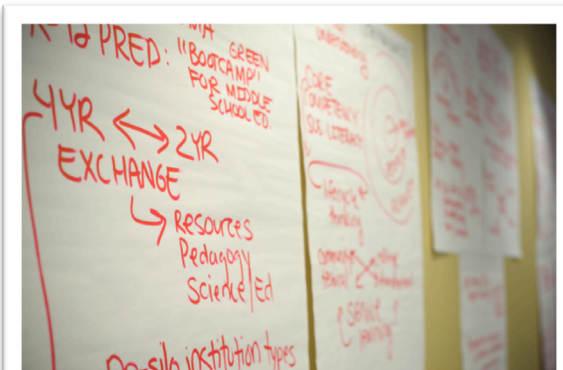
Participants began to synthesize their work and the speakers ideas during the section working session