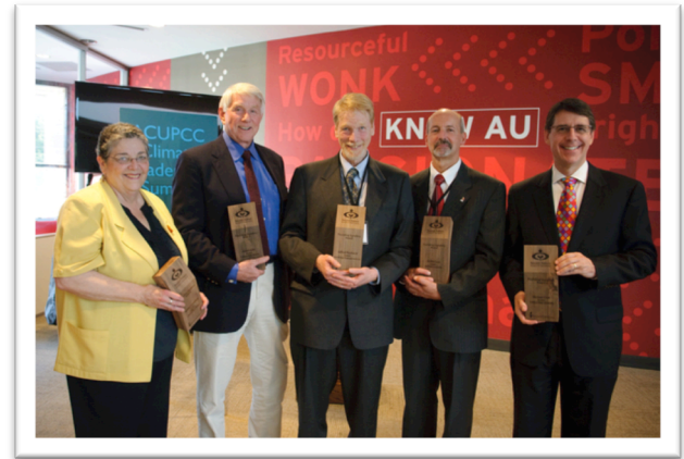
The attending founding signatories pose with awards during the opening reception

Five years ago, a group of visionary college and university presidents gathered to initiate the ACUPCC. They were motivated by their conviction that higher education had the capacity and responsibility to make a commitment to action for the sake of their students and society. The 12 founding signatories were recognized in a special awards ceremony during the opening reception.