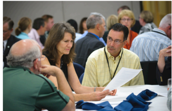
Signatory Presidents brainstorm during the World Cafe